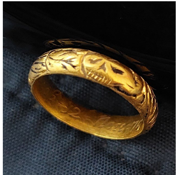
Herculaneum and Detectorist Displays featured during 2023-24